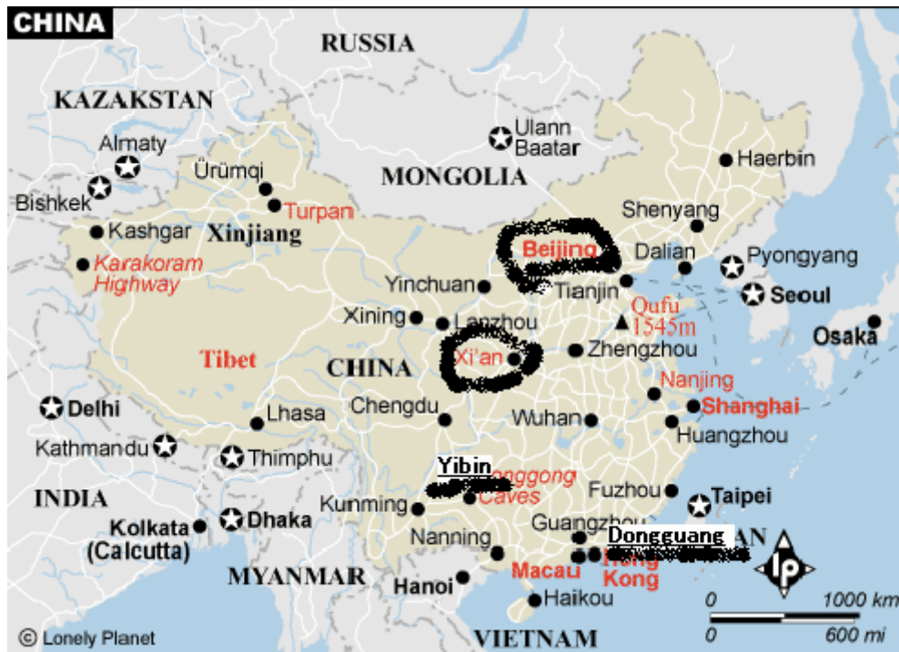
Figure 1 Map of survey sites