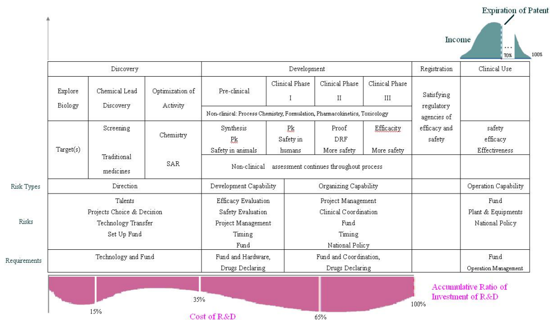
Figure 1: R&D Flow of an innovative drug, and the value and risks in each phase

accompanying this huge investment and high risk, is the return of a tremendous monopoly on profits during the patent protection period (usually 20 years) if an innovative drug has been developed successfully. The detailed R&D flow of an innovative drug, and the values and risks associated with each phase, are set out in Figure 1.