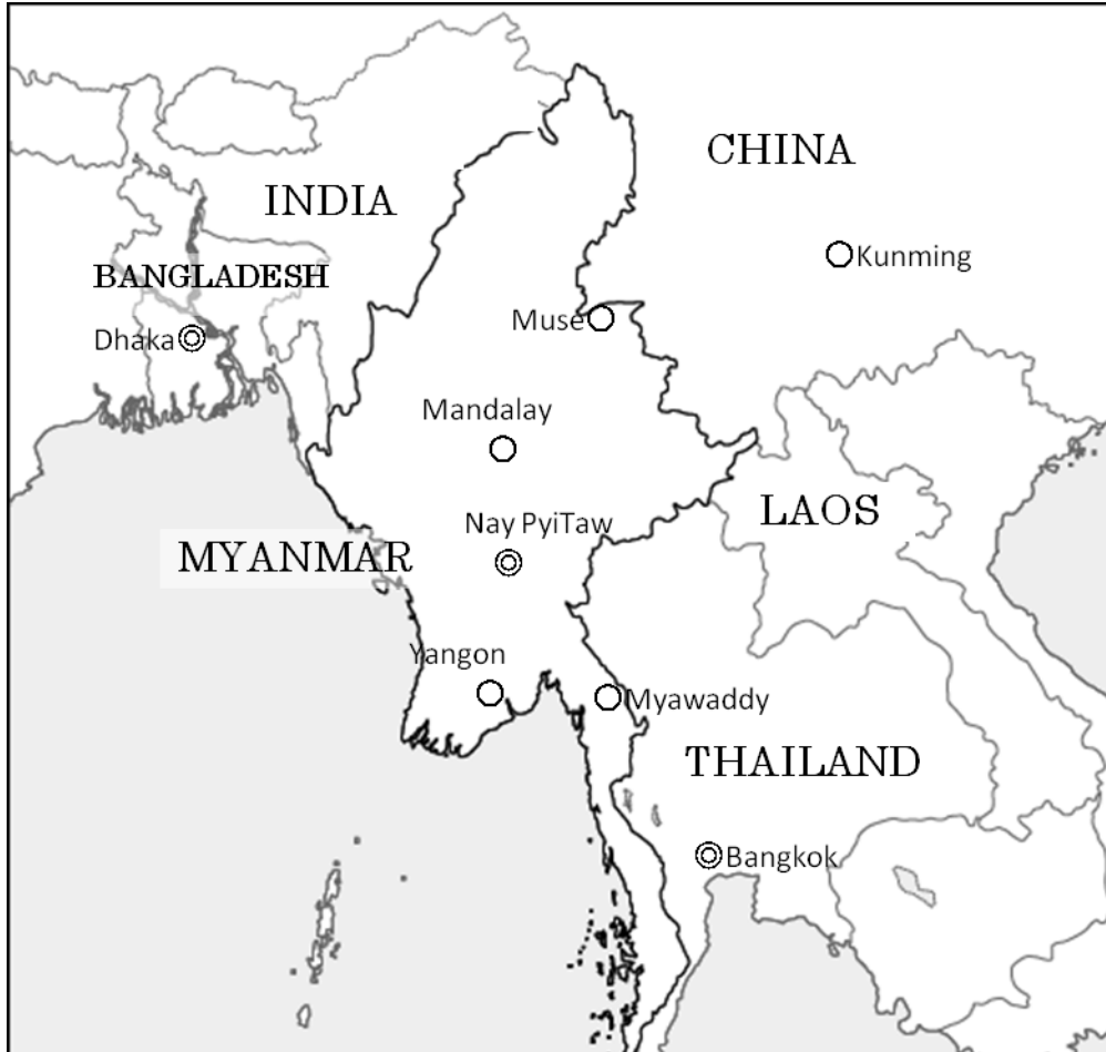
FIGURE 1 Map of Myanmar's Borders